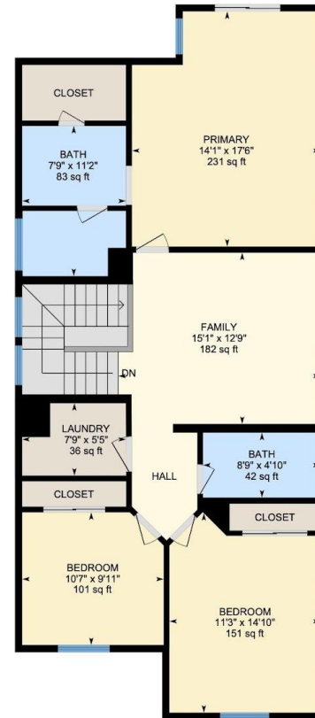
2nd Floor Exterior Area 1140.77 sq ft