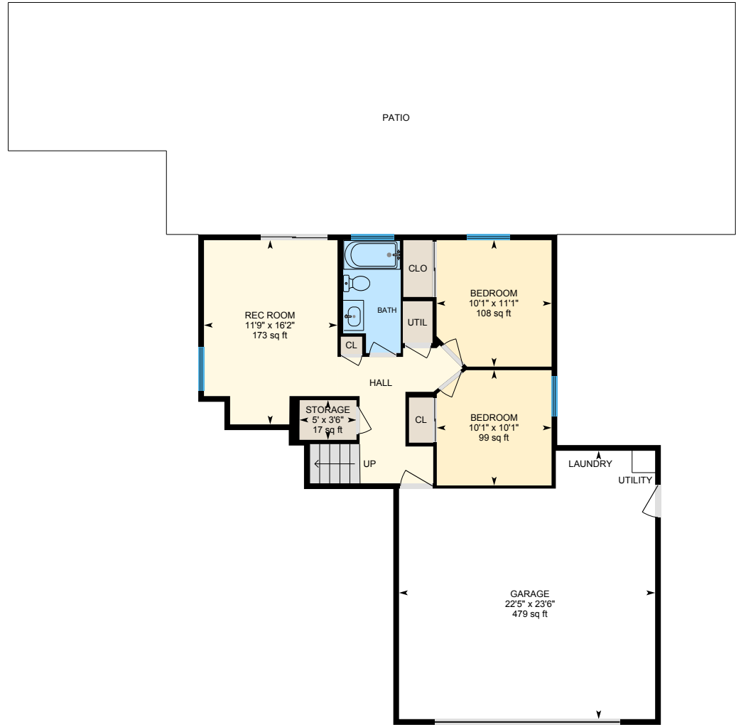
Lowerlevel Finished Area 648.86 sq ft