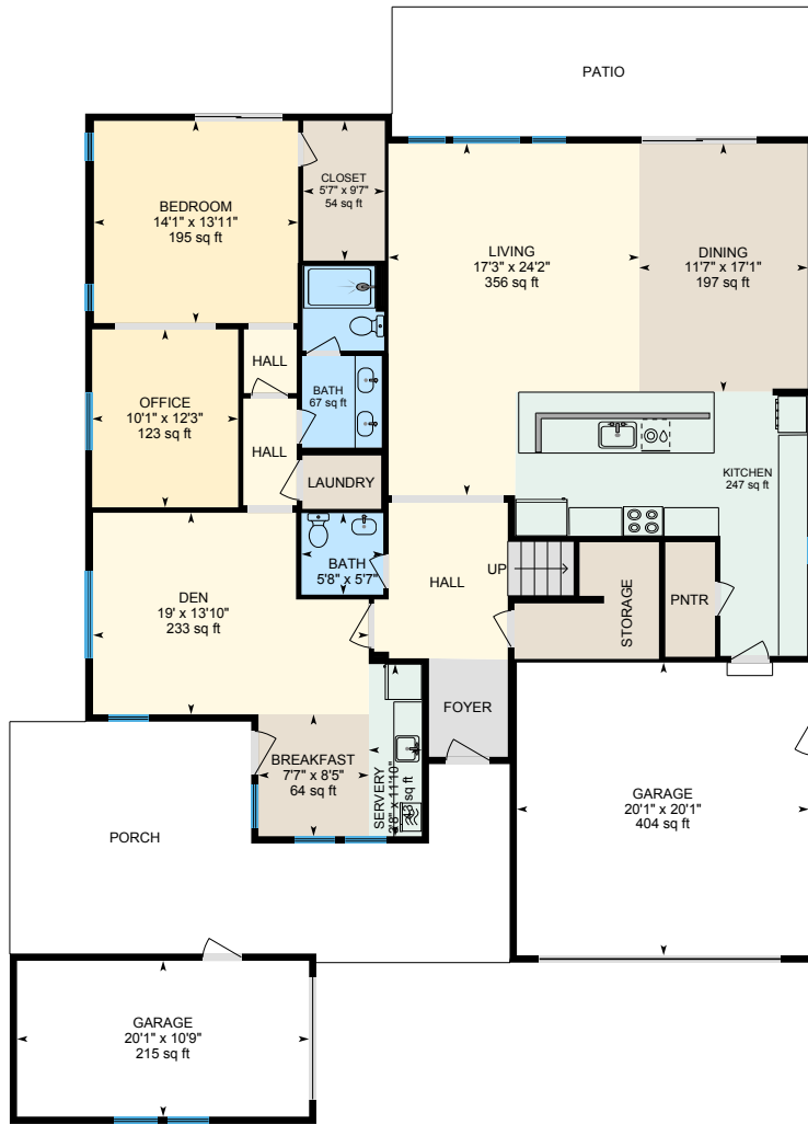
1st Floor Finished Area 2085.97 sq ft

Main Building: Above Grade Finished Area 4214.19 sq ft