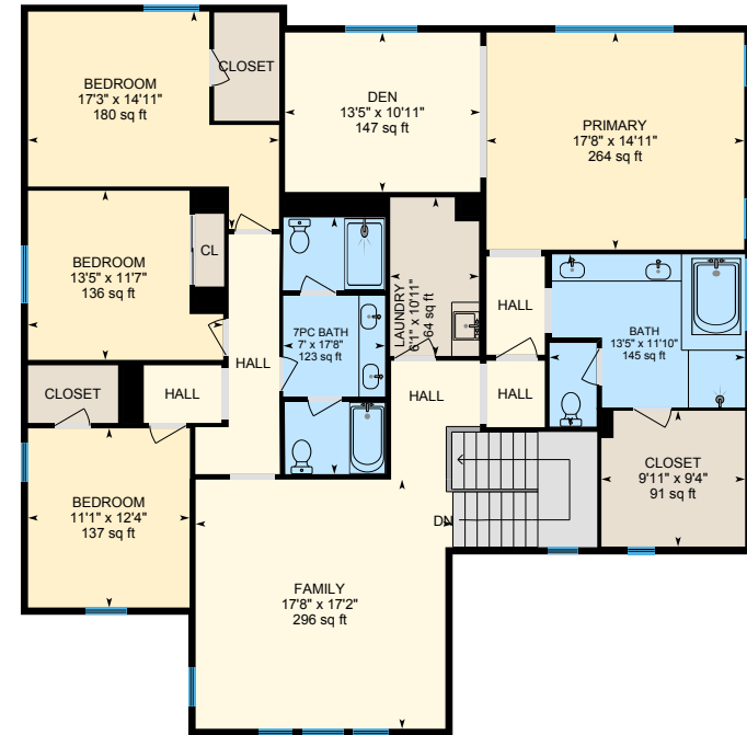
2nd Floor Finished Area 2128.22 sq ft