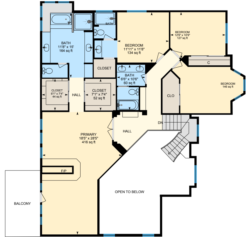
2nd Floor Finished Area 1673.29 sq ft