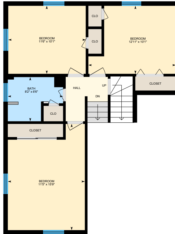
2nd Floor Exterior Area 627.00 sq ft