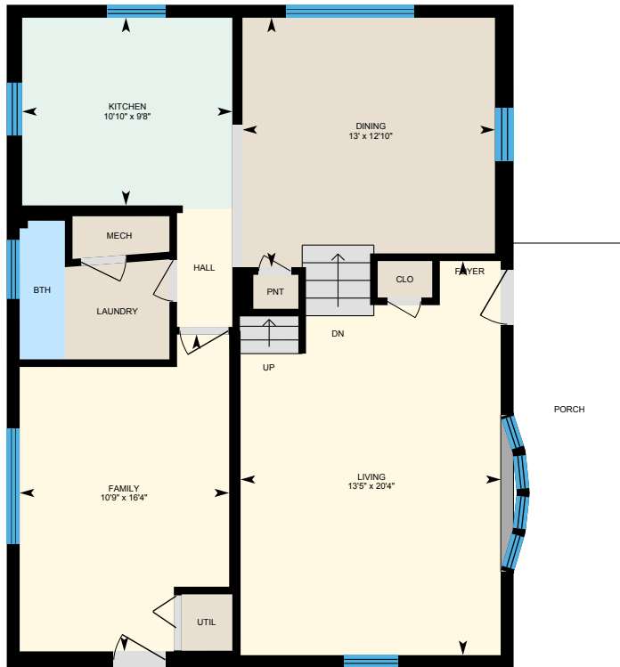
1st Floor Exterior Area 885.20 sq ft

Main Building: Total Exterior Area Above Grade 1817.83 sq ft