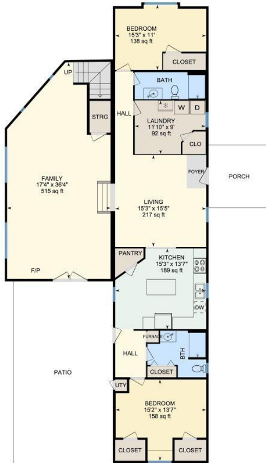
1st Floor Exterior Area 1848.19 sq ft