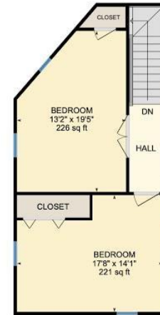
2nd Floor Exterior Area 638.60 sq ft