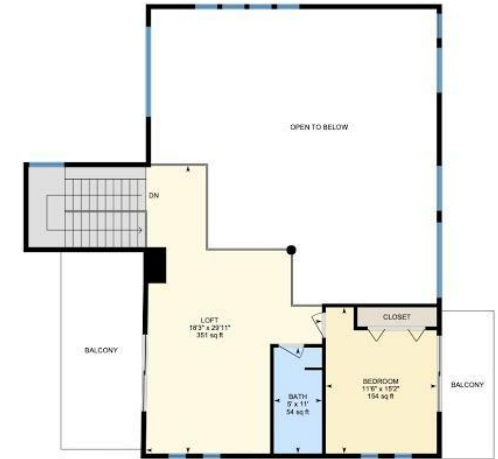
3rd Floor Exterior Area 808.19 sq ft