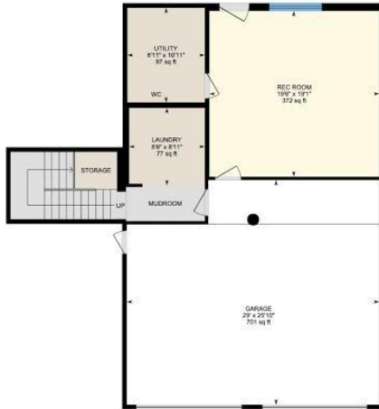
1st Floor Exterior Area 776.58 sq ft