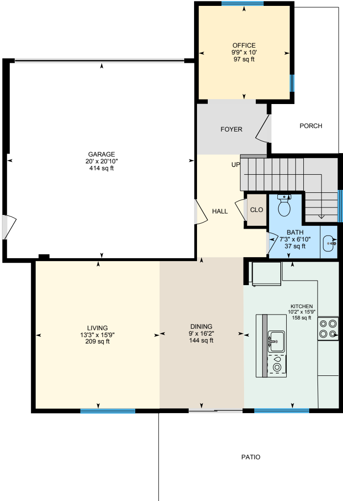
1st Floor Finished Area 891.39 sq ft

Main Building: Above Grade Finished Area 2014.34 sq ft