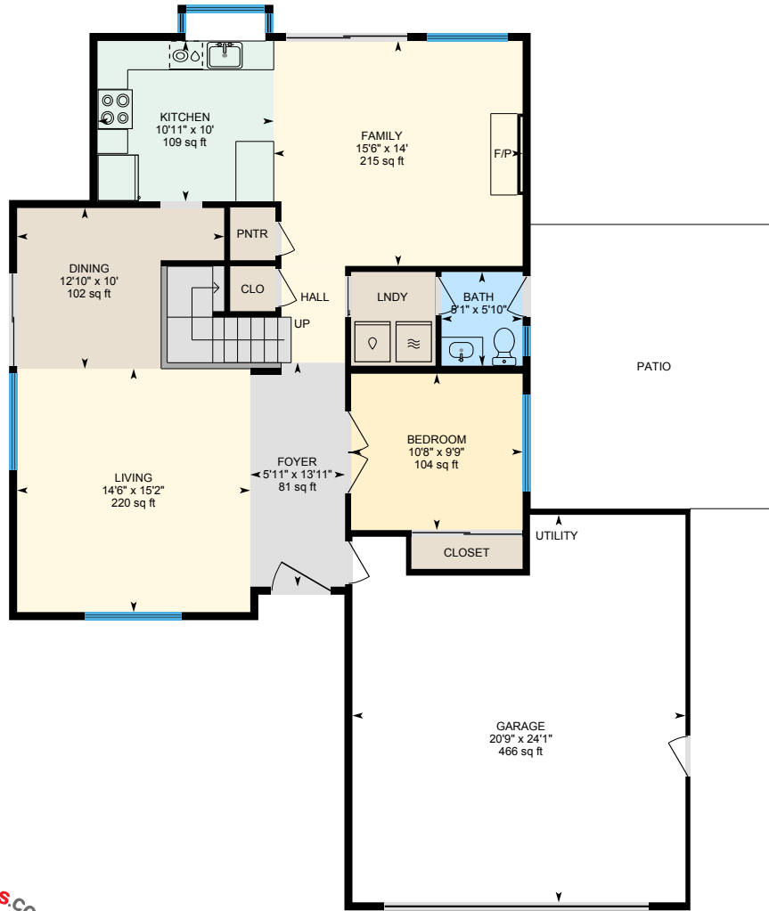
1st Floor Finished Area 1085.03 sq ft

Main Building: Above Grade Finished Area 1892.79 sq ft