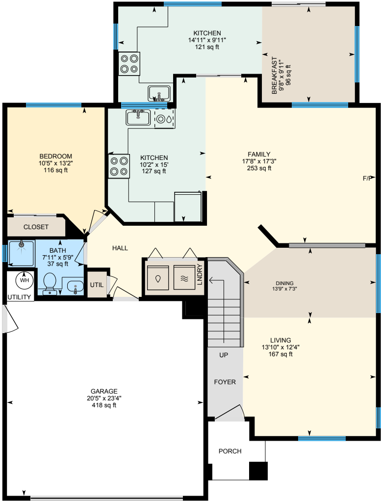
1st Floor Finished Area 1326.19 sq ft

Main Building: Above Grade Finished Area 2193.97 sq ft