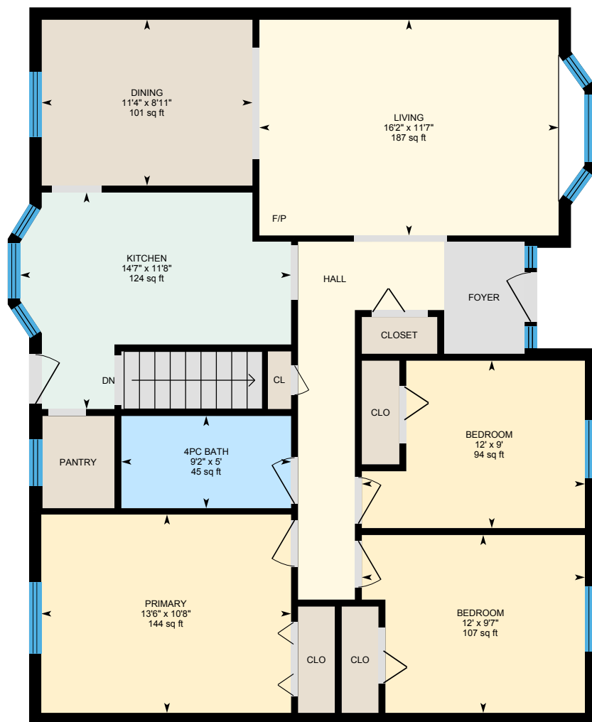
Main Floor Exterior Area 1153.49 sq ft

Main Building: Total Exterior Area Above Grade 1153.49 sq ft