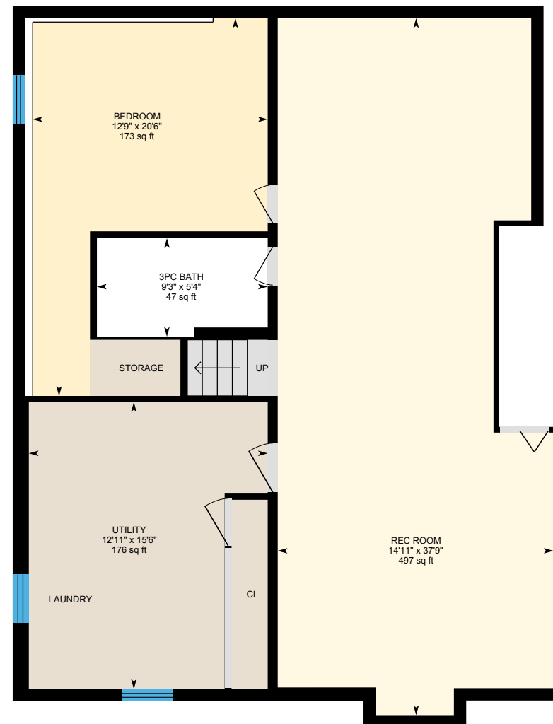
Basement (Below Grade) Exterior Area 1025.23 sq ft