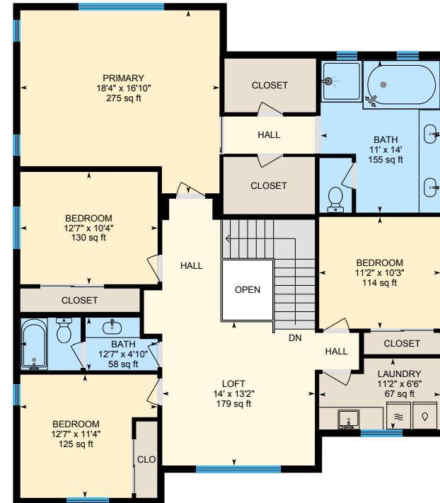
2nd Floor Finished Area 1609.79 sq ft