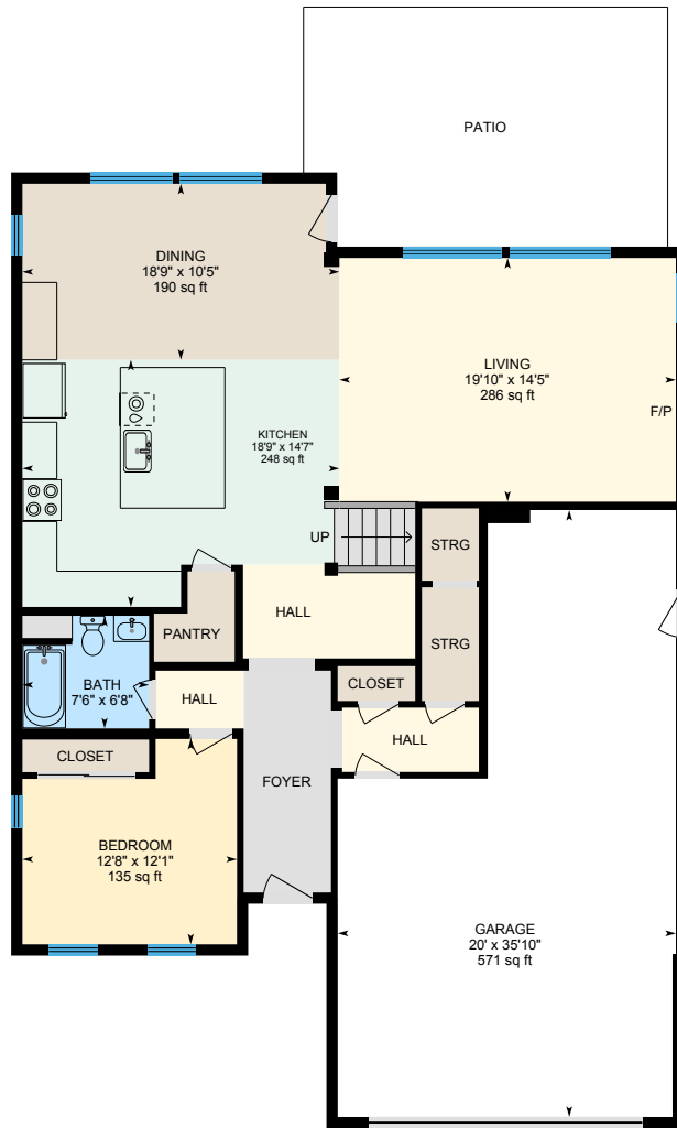
1st Floor Finished Area 1337.05 sq ft

Main Building: Above Grade Finished Area 2946.84 sq ft