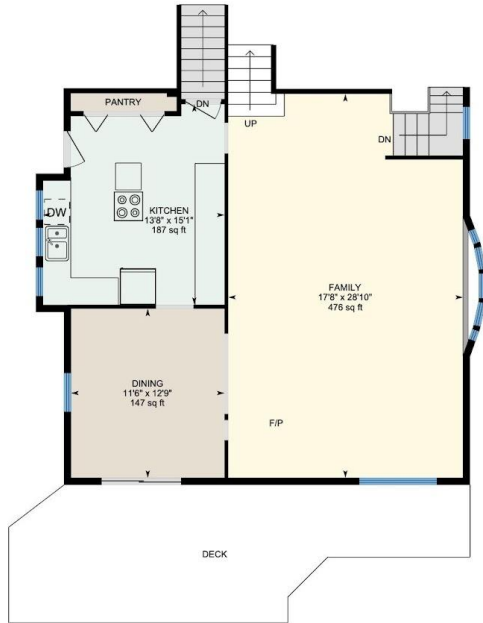
Main Floor Exterior Area 948.98 sq ft