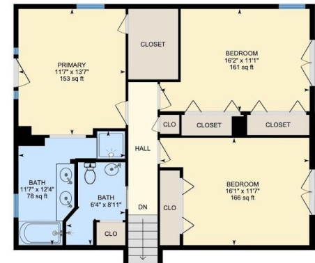
2nd Floor Exterior Area 873.23 sq ft