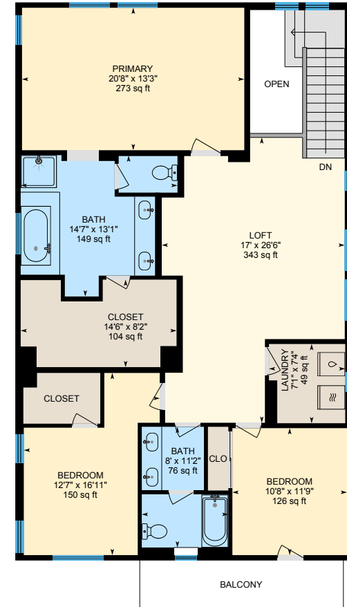
2nd Floor Finished Area 1552.75 sq ft