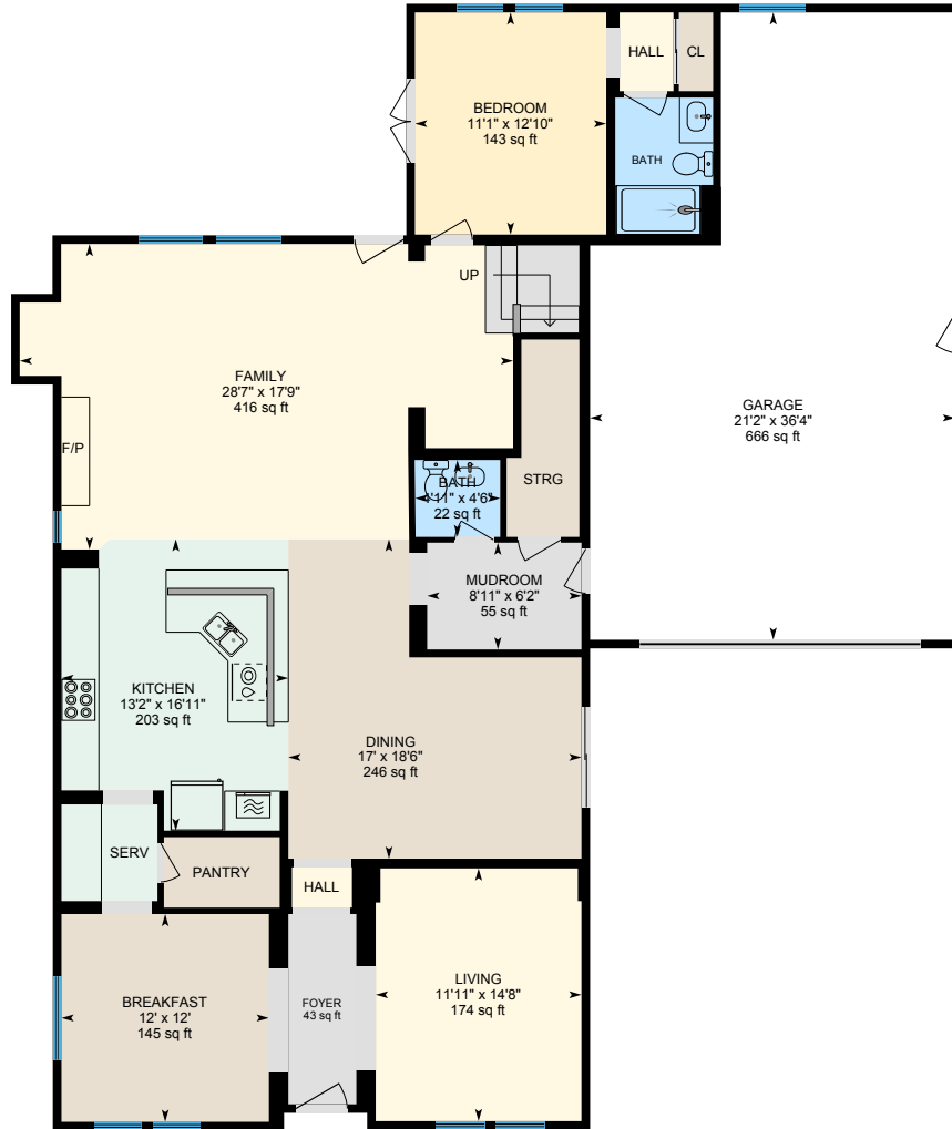
1st Floor Finished Area 1869.86 sq ft

Main Building: Above Grade Finished Area 3422.61 sq ft