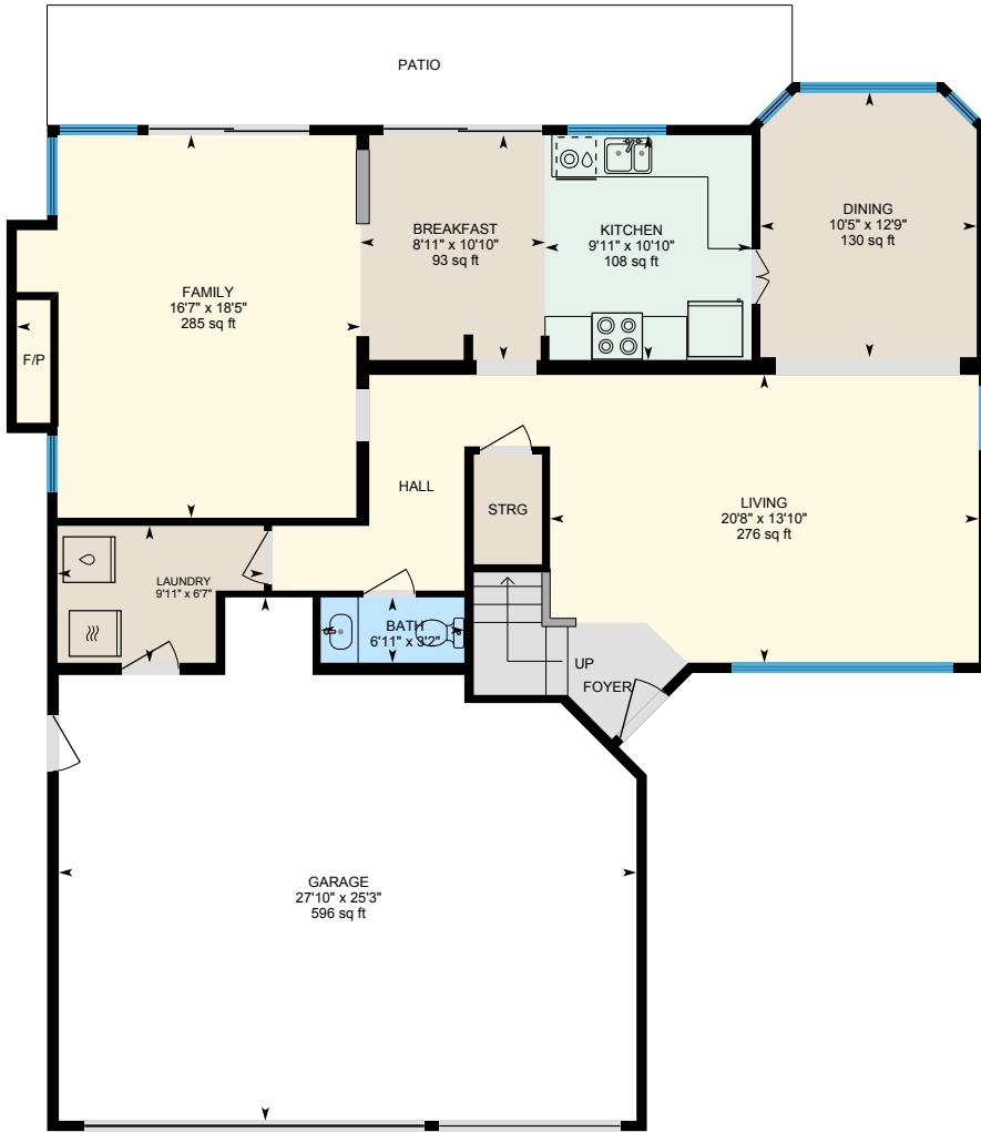
1st Floor Finished Area 1245.49 sq ft

Main Building: Above Grade Finished Area 2384.51 sq ft