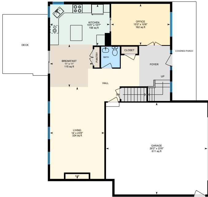
Main Floor Finished Area 1139.95 sq ft

Main Building: Above Grade Finished Area 2401.72 sq ft