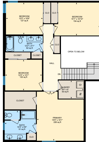
2nd Floor Finished Area 1261.77 sq ft