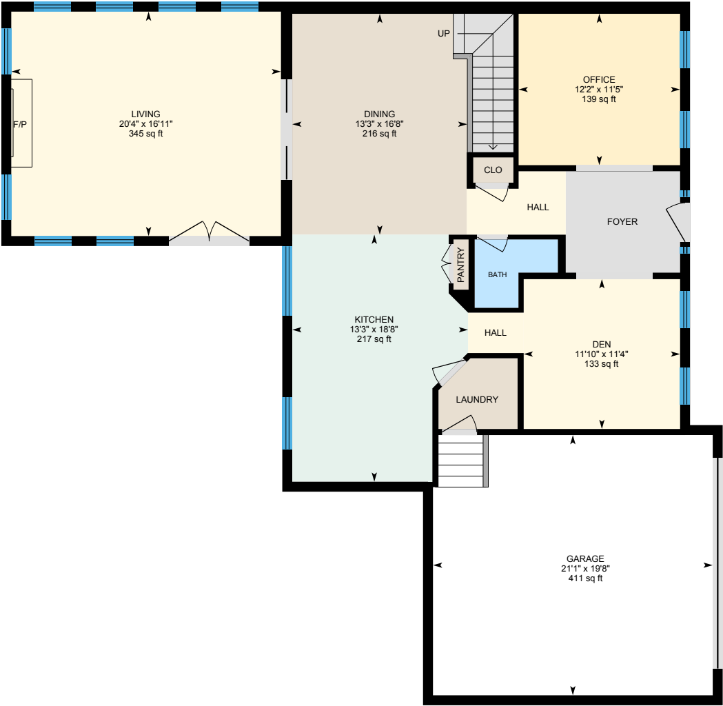
1st Floor Finished Area 1442.18 sq ft