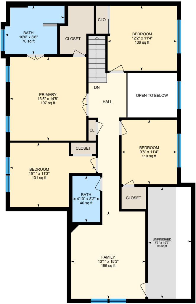
2nd Floor Finished Area 1268.78 sq ft