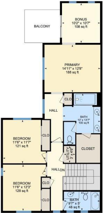
2nd Floor Exterior Area 1122.56 sq ft