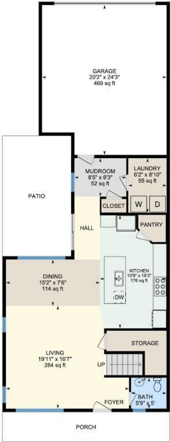
1st Floor Exterior Area 942.08 sq ft