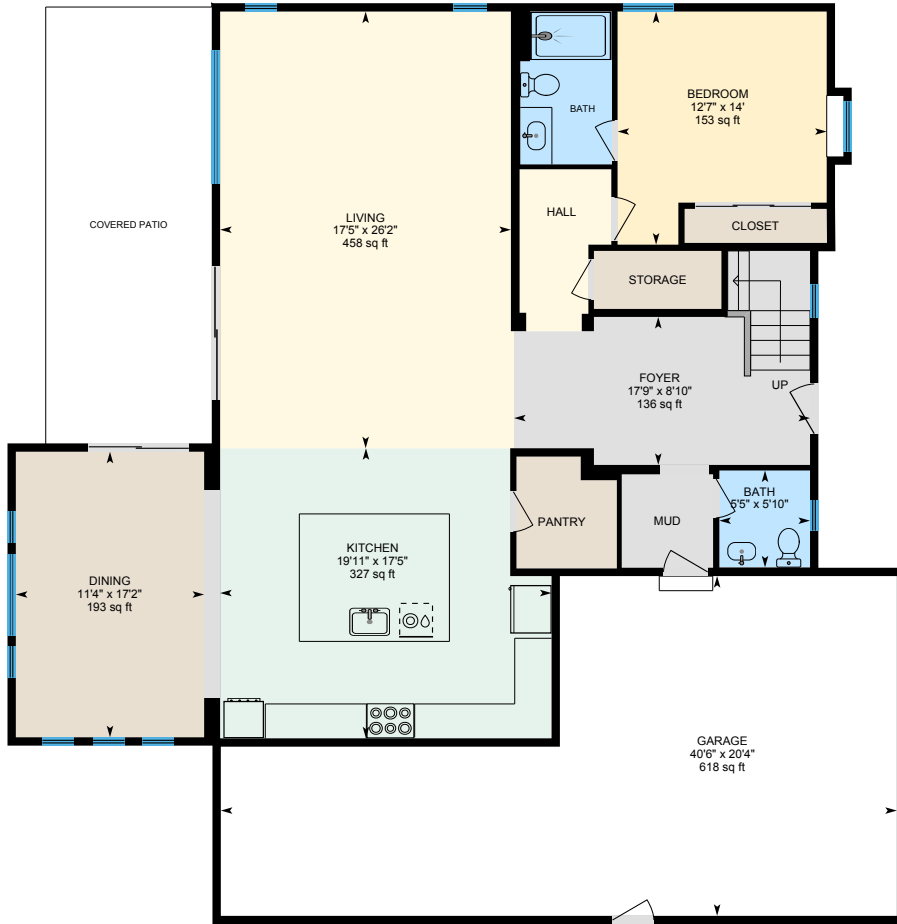
1st Floor Finished Area 1700.02 sq ft

Main Building: Above Grade Finished Area 3846.40 sq ft