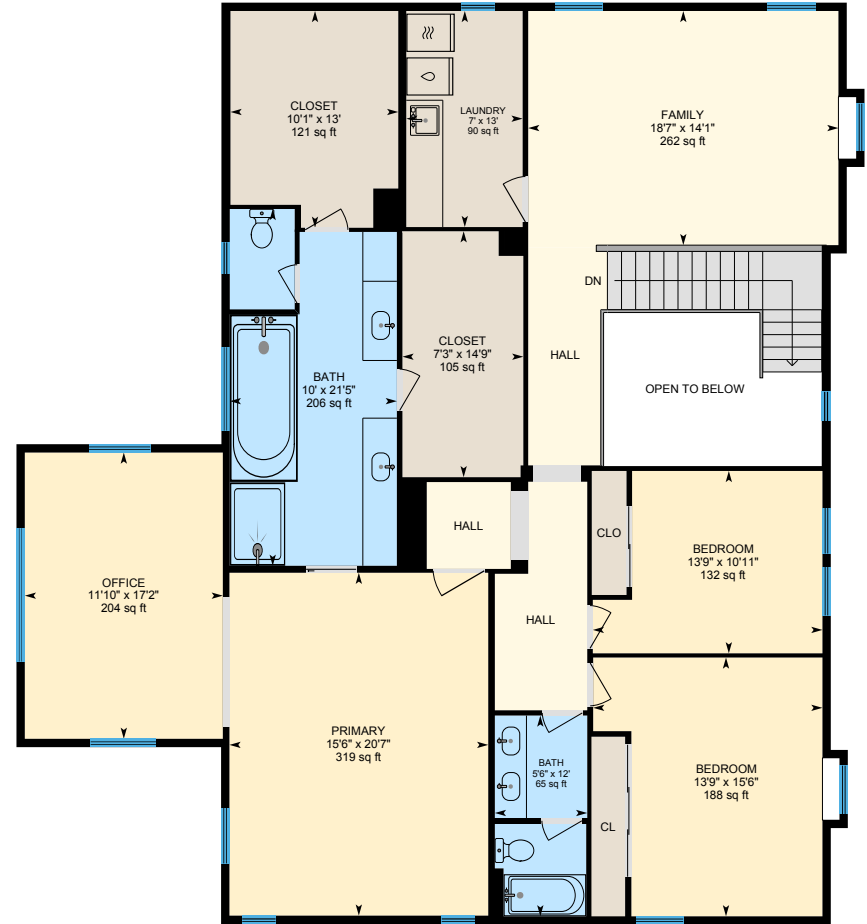
2nd Floor Finished Area 2146.38 sq ft