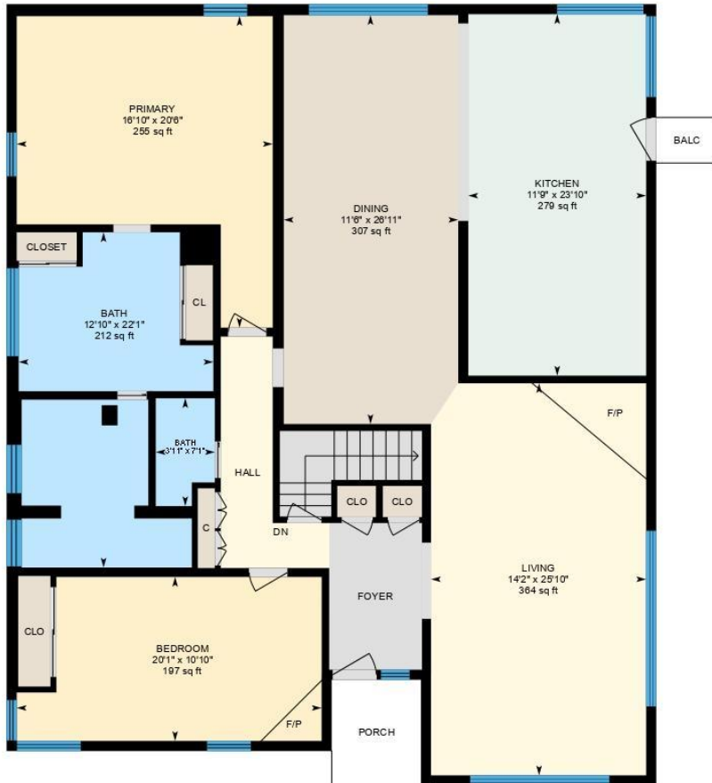
Upper Finished Area 2106.47 sq ft