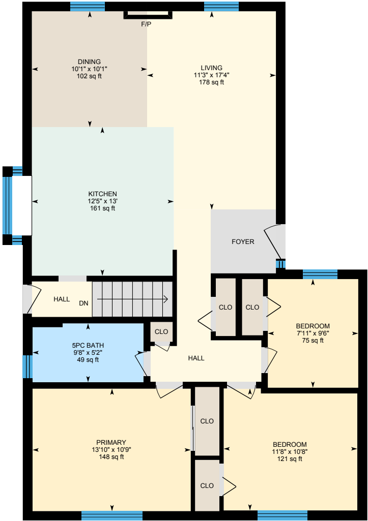
Main Floor Exterior Area 1198.72 sq ft

Main Building: Total Exterior Area Above Grade 1198.72 sq ft