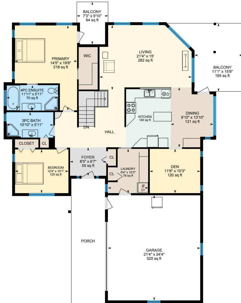
Main Floor (9ft - 10ft 10in) Exterior Area 1719.54 sq ft

Main Building: Total Exterior Area Above Grade 3419.37 sq ft