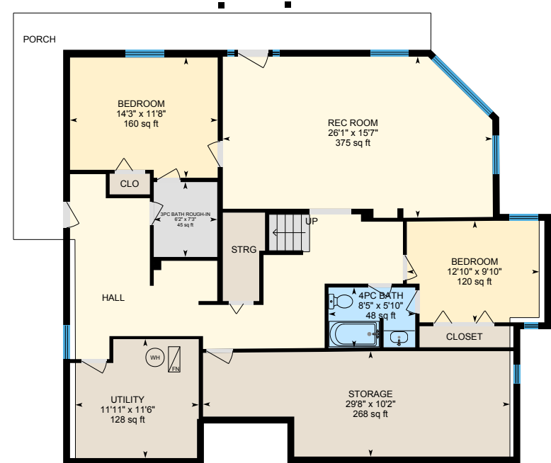
Lower (8ft) Exterior Area 1699.83 sq ft