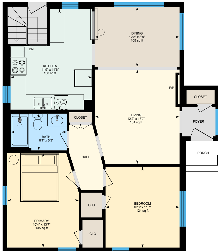
Main Floor Finished Area 968.76 sq ft

Main Building: Above Grade Finished Area 968.76 sq ft