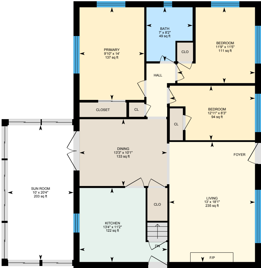
Main Floor Finished Area 1142.97 sq ft

Main Building: Above Grade Finished Area 1142.97 sq ft