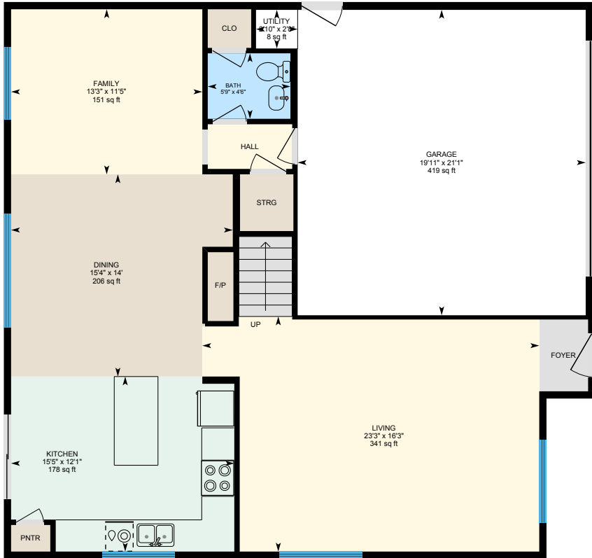
1st Floor Finished Area 1078.76 sq ft

Main Building: Above Grade Finished Area 2621.12 sq ft