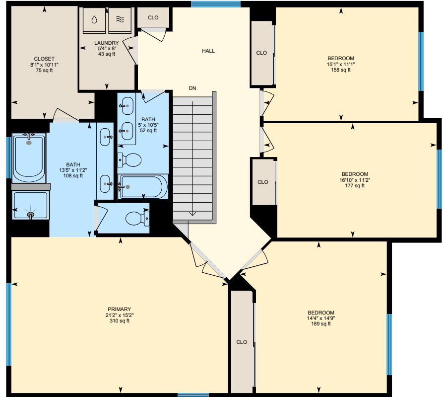
2nd Floor Finished Area 1542.37 sq ft