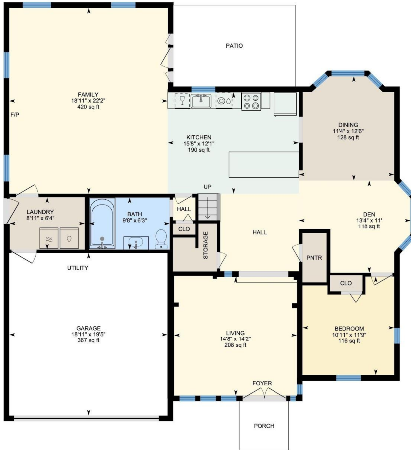
1st Floor Finished Area 1609.10 sq ft