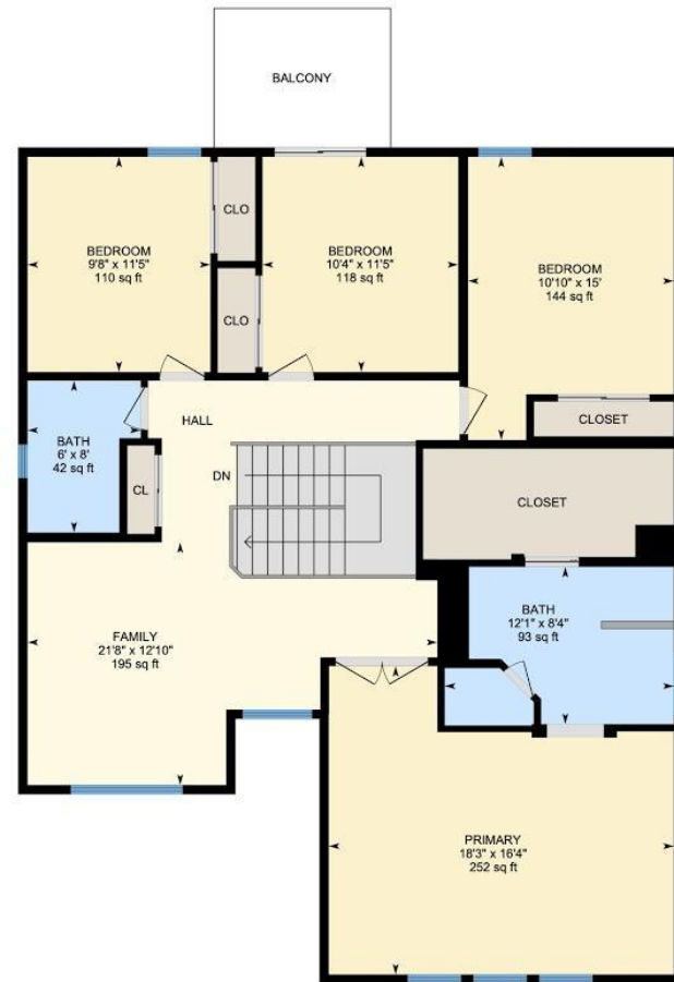
2nd Floor Exterior Area 1373.06 sq ft