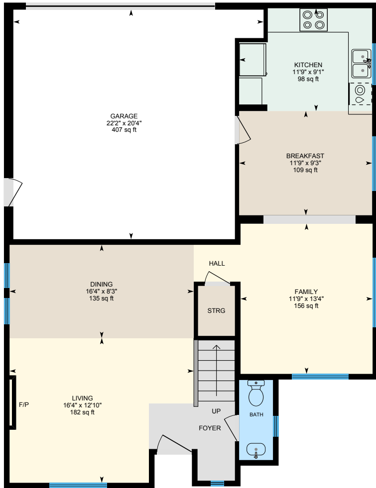
1st Floor Finished Area 889.06 sq ft

Main Building: Above Grade Finished Area 2281.81 sq ft