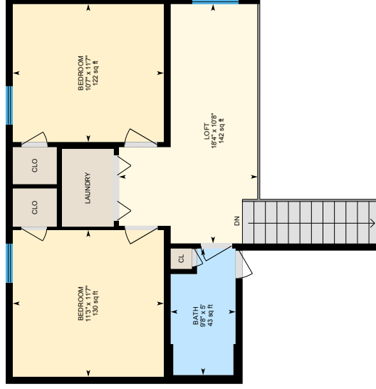
2nd Floor Exterior Area 610.38 sq ft