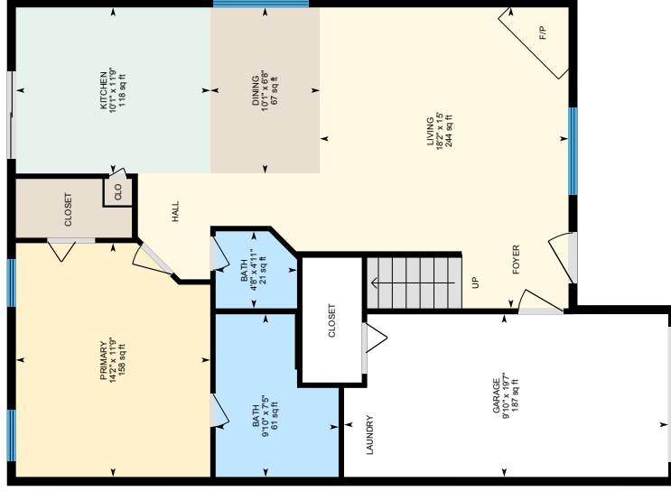
Main Floor Exterior Area 854.16 sq ft

Main Building: Total Exterior Area Above Grade 1484.53 sq ft