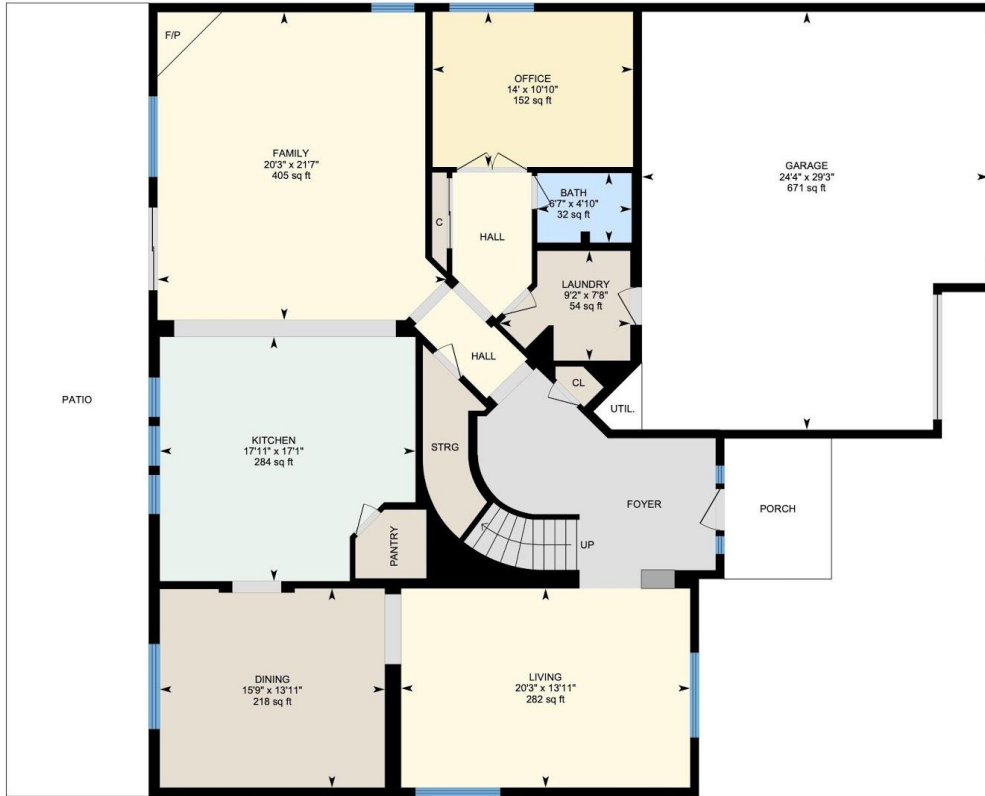
1st Floor Exterior Area 2027.75 sq ft

Main Building: Total Exterior Area Above Grade 3909.39 sq ft