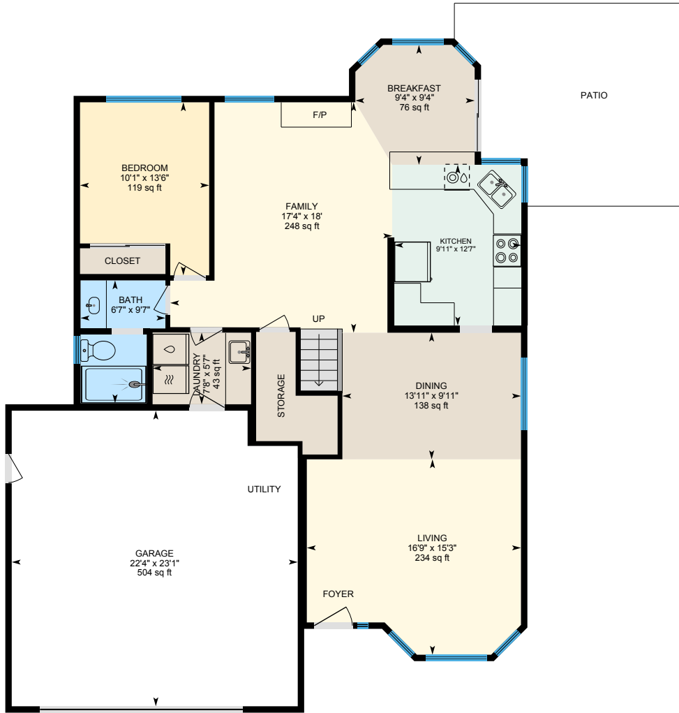
1st Floor Finished Area 1231.37 sq ft

Main Building: Above Grade Finished Area 2471.25 sq ft