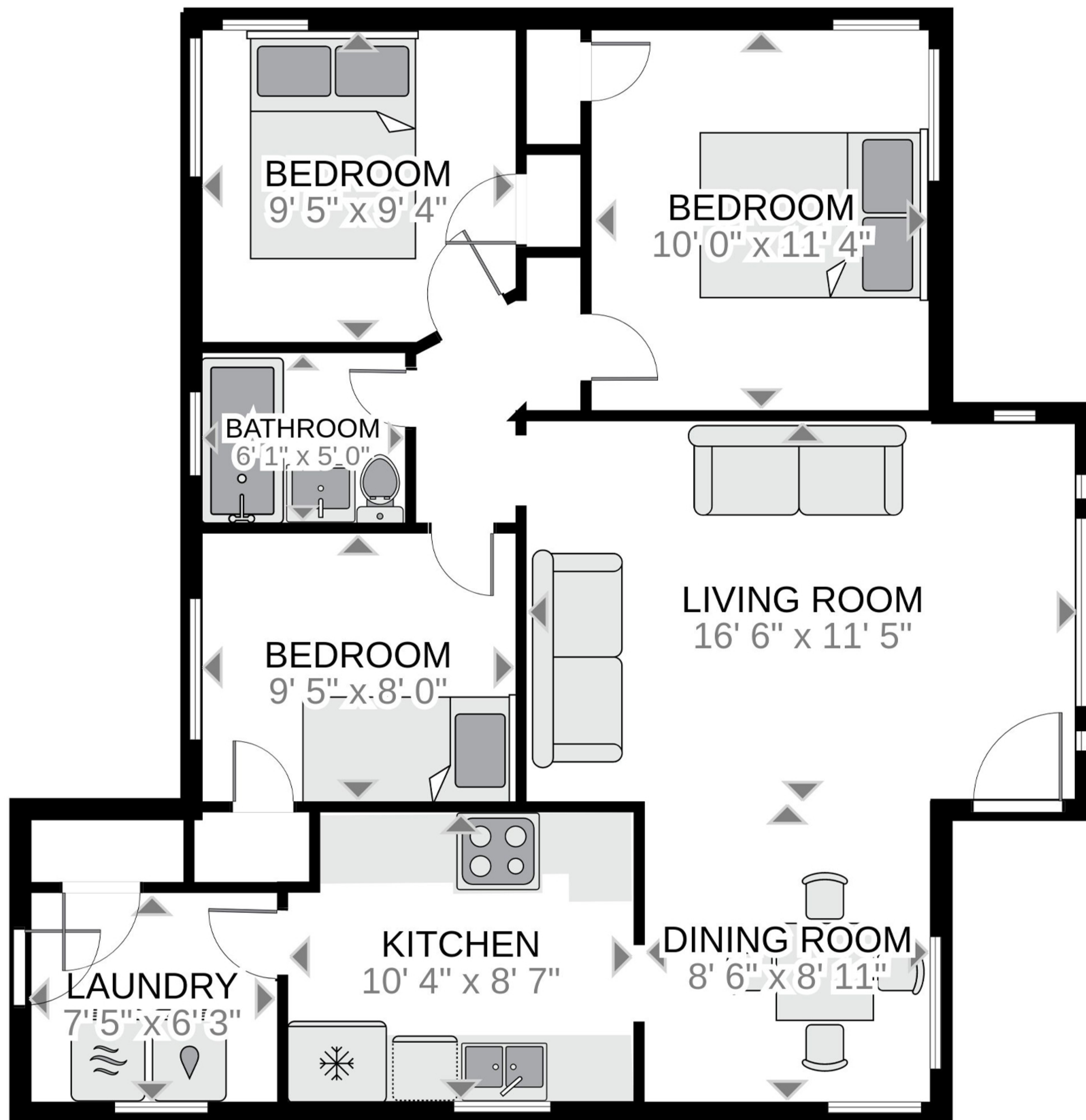
MAIN FLOOR Outside Area 881 sq. ft.