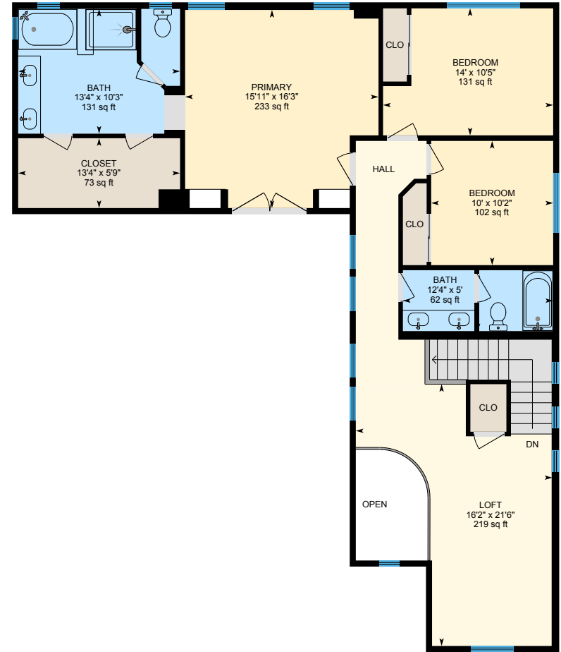
2nd Floor Finished Area 1283.77 sq ft