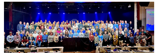
The iTrip Vacations Team