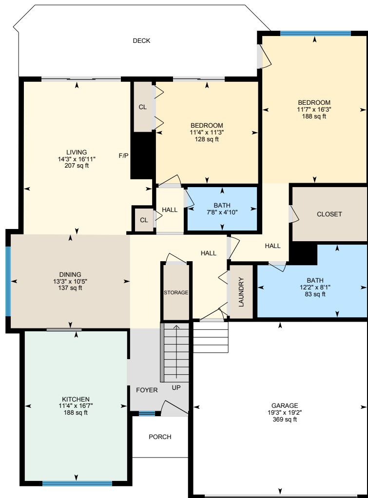
Main Floor Finished Area 1445.89 sq ft

Main Building: Above Grade Finished Area 1859.11 sq ft