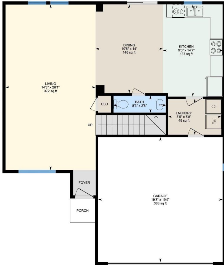
1st Floor Finished Area 859.53 sq ft