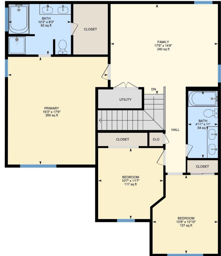
2nd Floor Finished Area 1204.48 sq ft