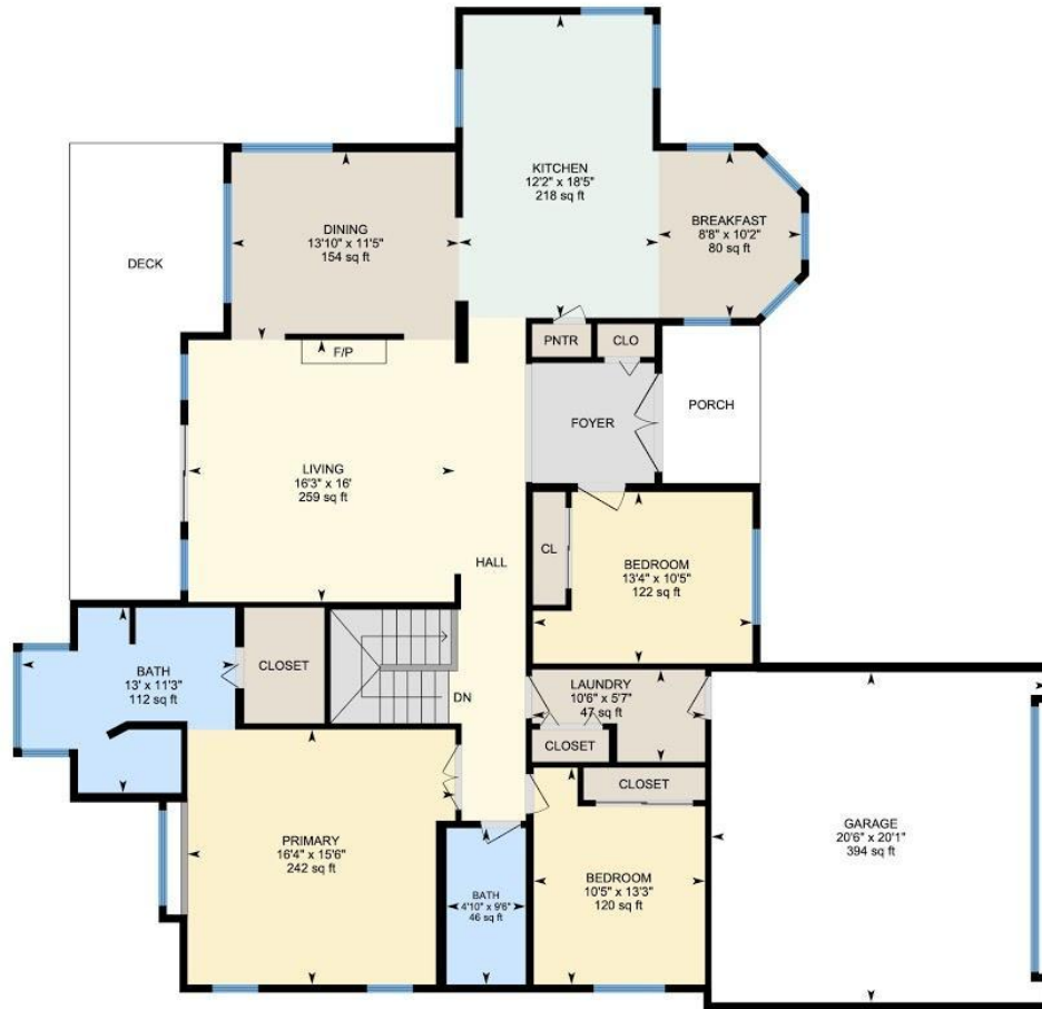
1st Floor Exterior Area 1923.08 sq ft

Main Building: Total Exterior Area Above Grade 3027.97 sq ft