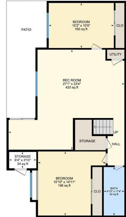
Lower Level Exterior Area 1104.89 sq ft