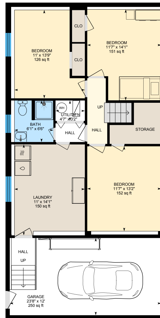
Basement (Below Grade) Finished Area 839.23 sq ft