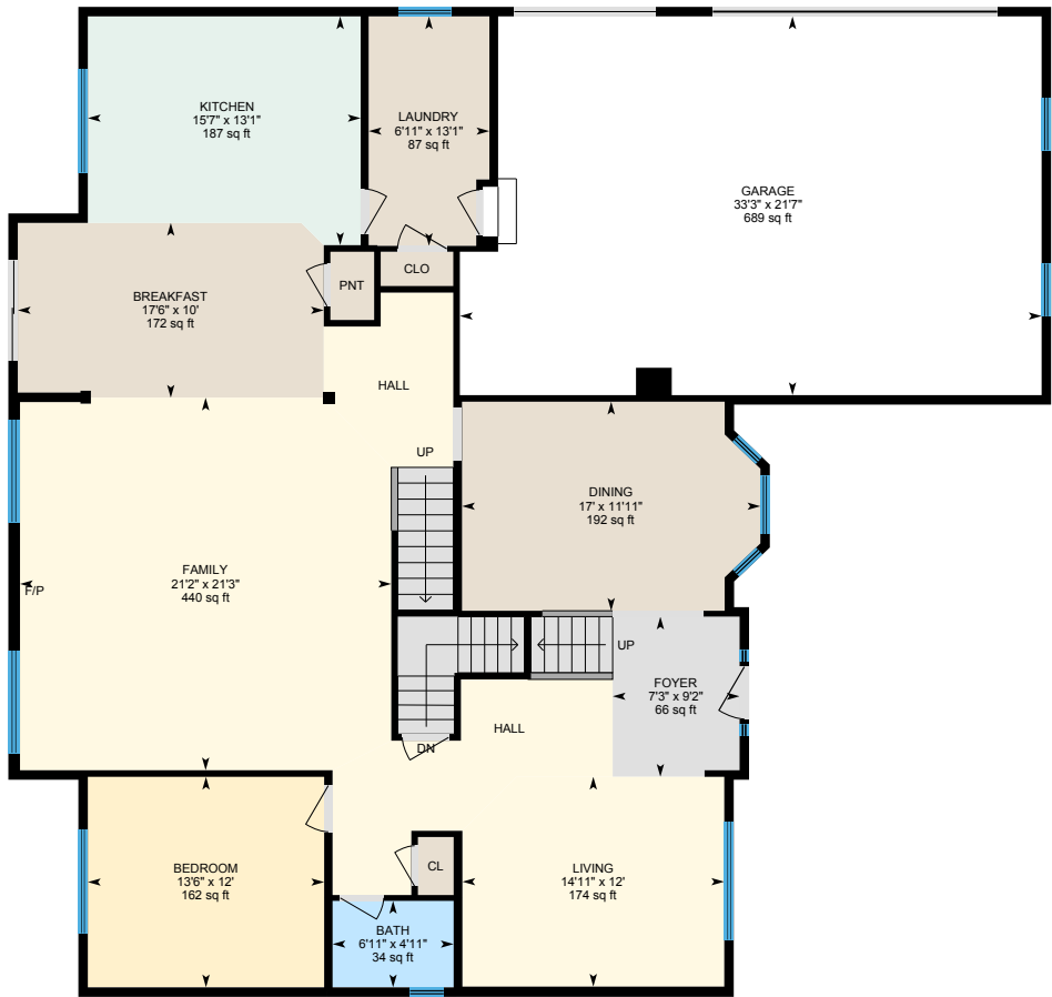
Main Floor Finished Area 1945.56 sq ft

Main Building: Above Grade Finished Area 3744.93 sq ft