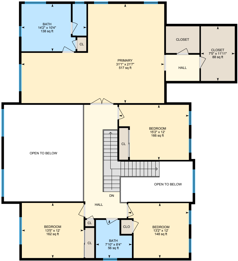
2nd Floor Finished Area 1799.37 sq ft