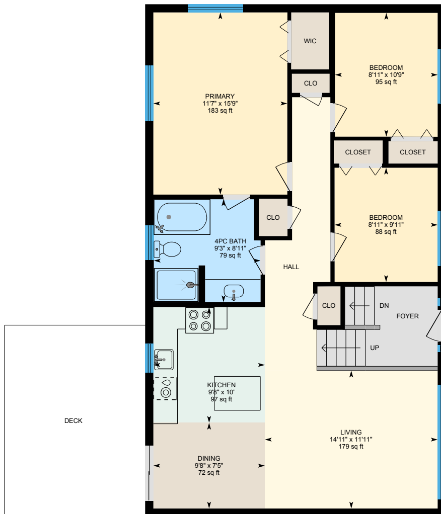
Main Floor Exterior Area 1156.09 sq ft

Main Building: Total Exterior Area 2222.24 sq ft