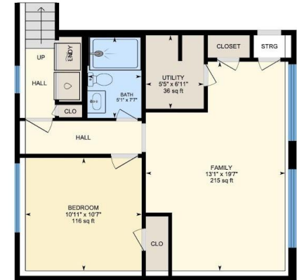
Lower Floor (Below Grade) Exterior Area 592.32 sq ft