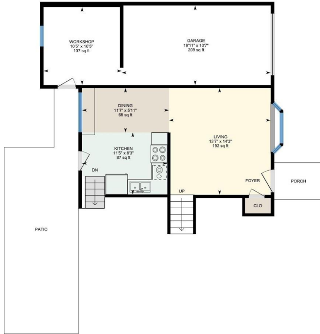
Main Floor Exterior Area 405.28 sq ft