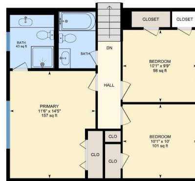
Upper Floor Exterior Area 611.96 sq ft