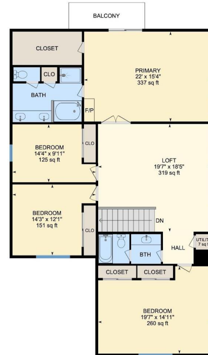
2nd Floor Exterior Area 1727.22 sq ft