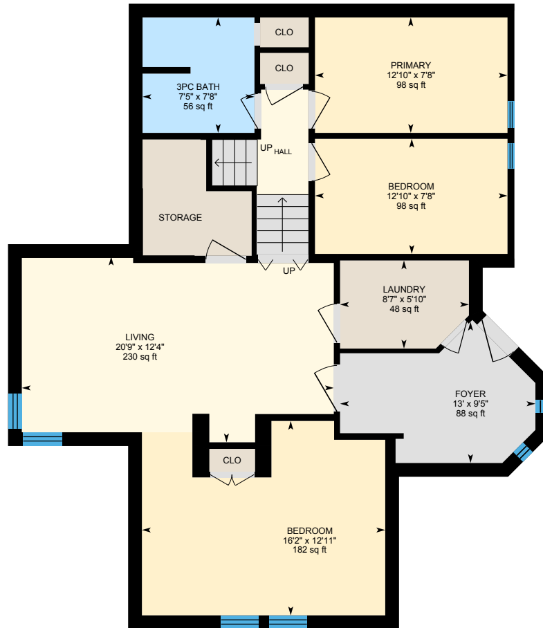
1st Floor Exterior Area 1109.58 sq ft

Main Building: Total Exterior Area Above Grade 2103.62 sq ft