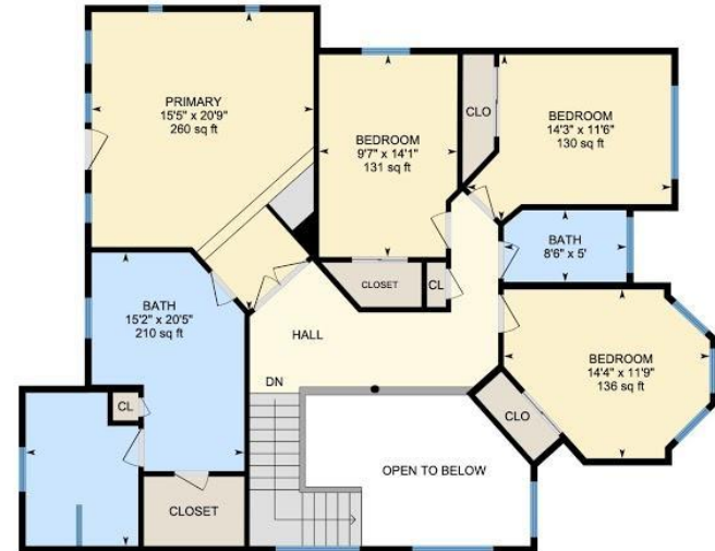
2nd Floor Exterior Area 1356.86 sq ft