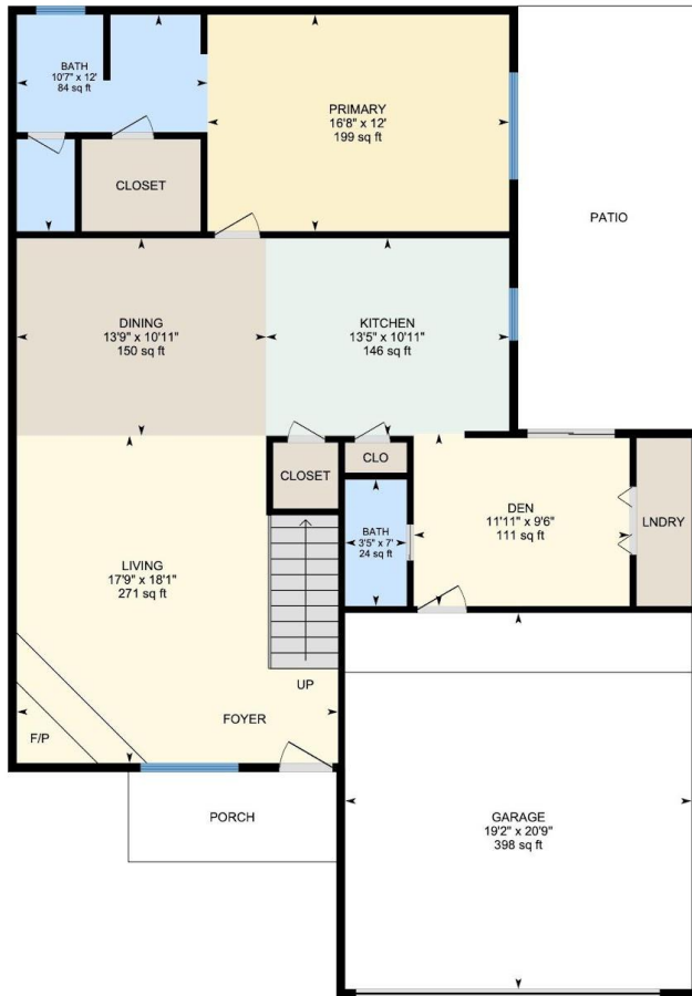
1st Floor Finished Area 1213.27 sq ft