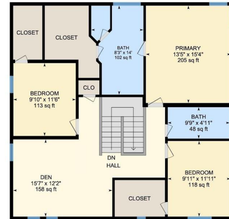
2nd Floor Exterior Area 1212.84 sq ft