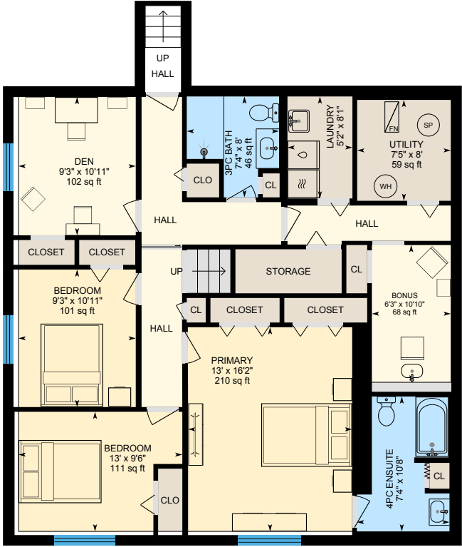
Basement (Below Grade) Exterior Area 1291.21 sq ft