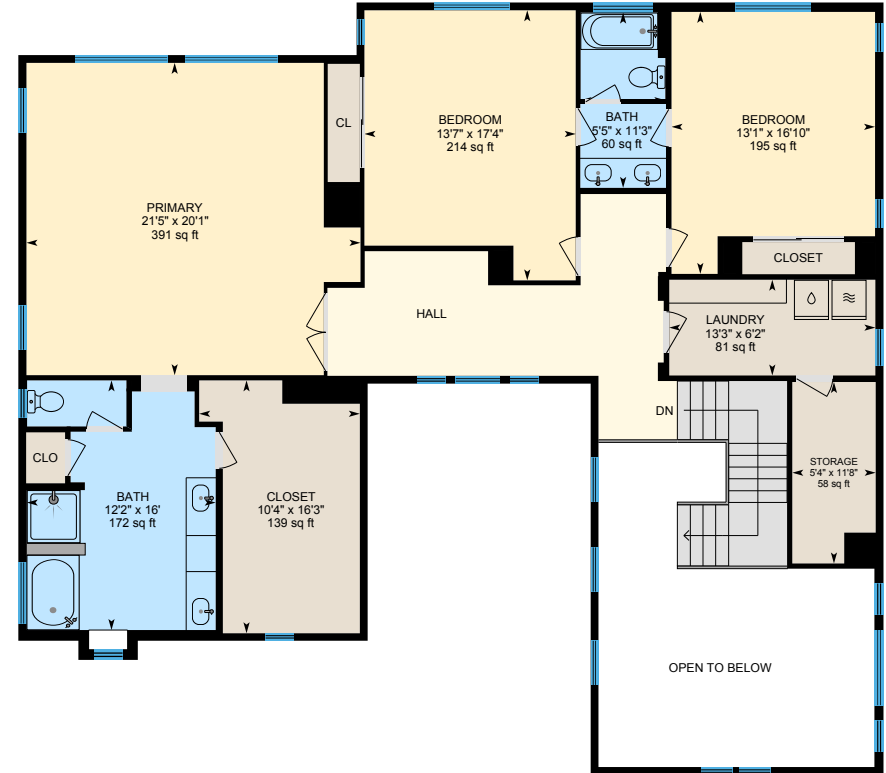
2nd Floor Finished Area 1814.17 sq ft