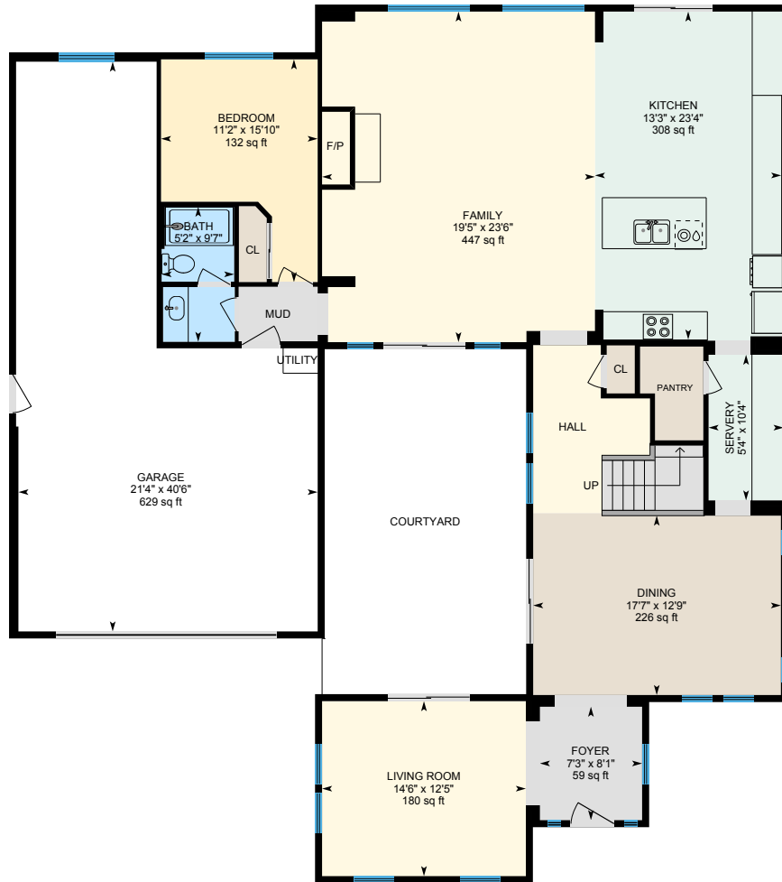
1st Floor Finished Area 1813.94 sq ft

Main Building: Above Grade Finished Area 3628.11 sq ft