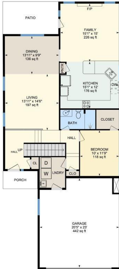
1st Floor Exterior Area 1275.27 sq ft