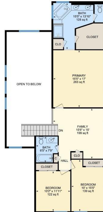
2nd Floor Exterior Area 1220.08 sq ft