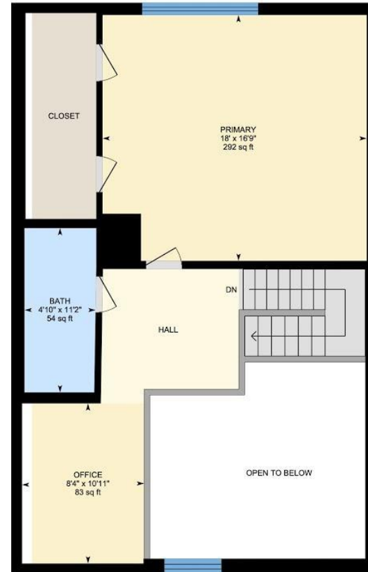
2nd Floor Exterior Area 756.25 sq ft